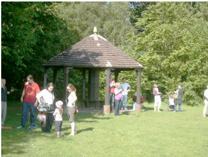
Gazebo Opening. Pollok Park. Sunday 31/05/2009.