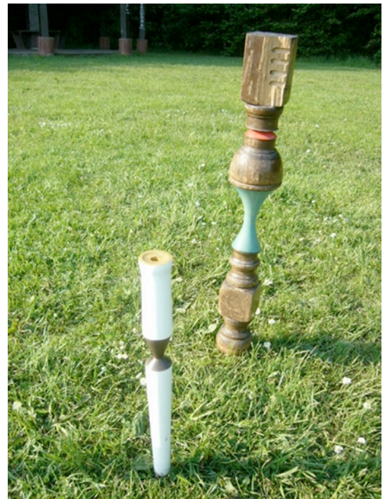
Form Minus Function 4 to 8 - Hugh.