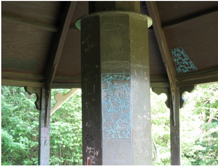
Installation View - Chris.