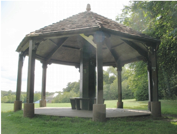
Gazebo (with Inverted Corner Detail) - Chris.