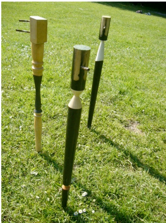
Form Minus Function 4 to 8 - Hugh.