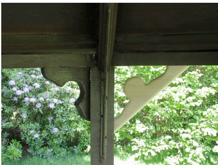
Inverted Corner Detail (Interior) - Chris.