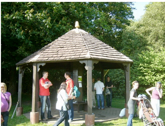
Gazebo Opening. Pollok Park. Sunday 31/05/2009.