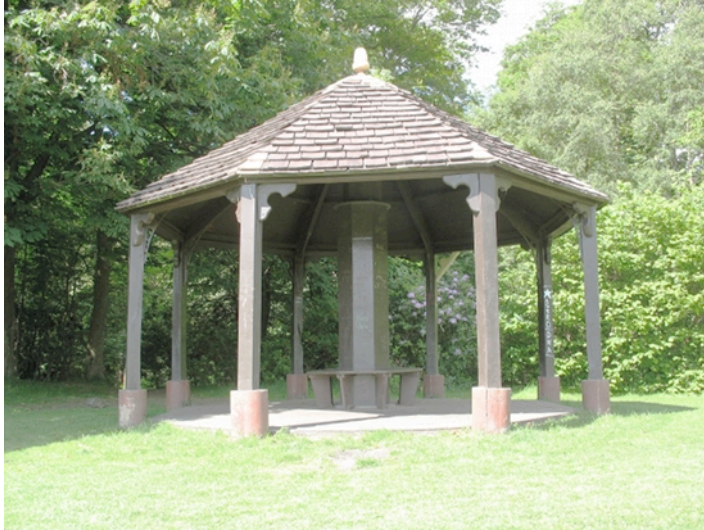
Gazebo. Pollok Park. 2009.