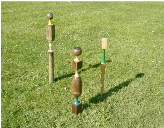
Form Minus Function 1, 2 & 3 - Hugh.