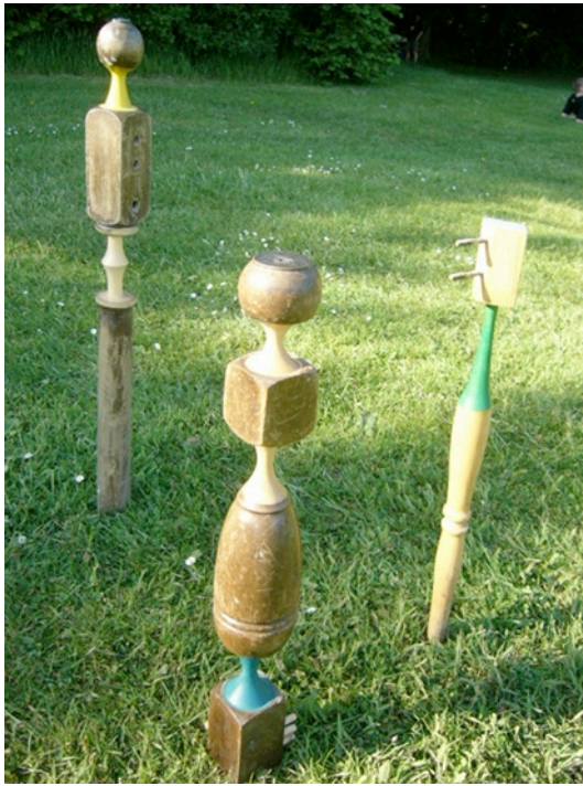
Form Minus Function 1, 2 & 3 - Hugh.