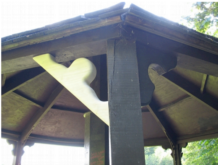
Inverted Corner Detail (Exterior) - Chris.