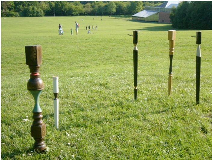
Form Minus Function 4 to 8 - Hugh.