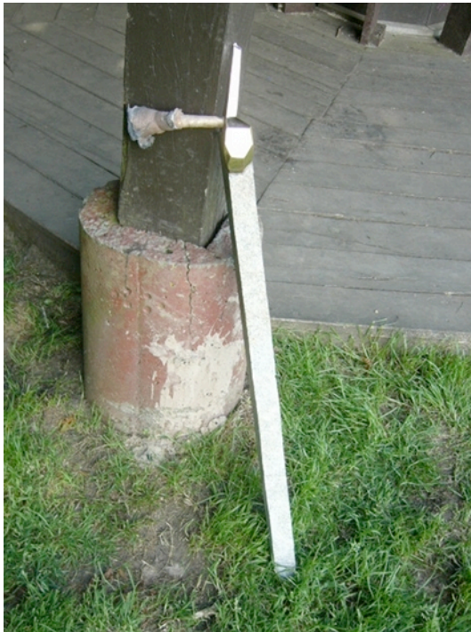
Molten bronze poured onto granite - Hugh.