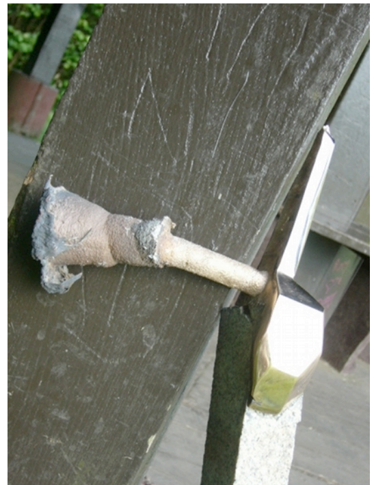
Molten bronze poured onto granite - Hugh.