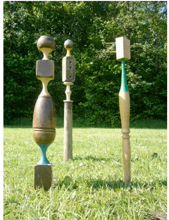
Form Minus Function 1, 2 & 3 - Hugh.